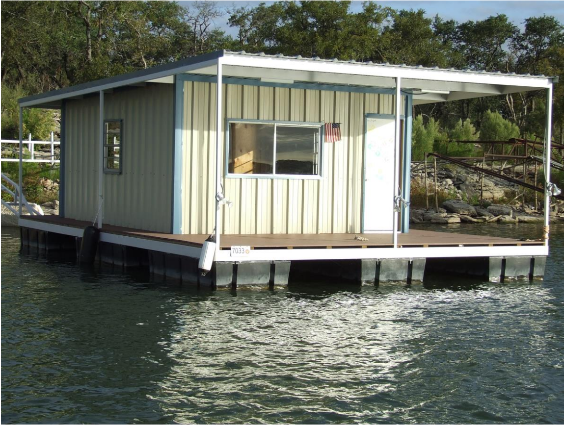
EXAMPLE OF DOCK BUILT TO DISTRICT STANDARDS THE CABIN IS OPTIONAL